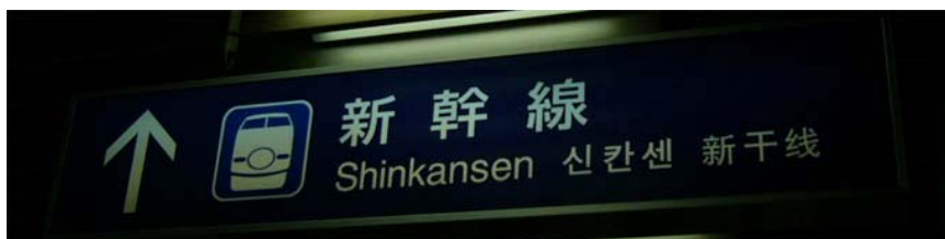
Follow the sign of Shin-Kansen at the Shin-Osaka station