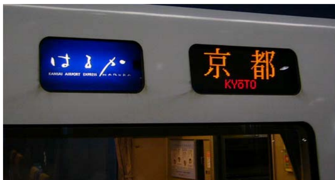
Haruka (this one is bound for Kyoto via Shin-Osaka)

(4) It takes about 50 minutes to Shin-Osaka station. There are many platforms at Shin-Osaka, you have to go to the form (usually 20,21,22) which the Shin-Kansen to Aioi or Himeji leaves. The Shin-Osaka station is very confusing. The best way to find the platform is to ask to the station staff who can speak even poor English. Show your ticket, they will take you to the proper form. Most difficult part of trip to SPring-8 is changing trains from Haruka to Shin-Kansen at the Shin-Osaka station.