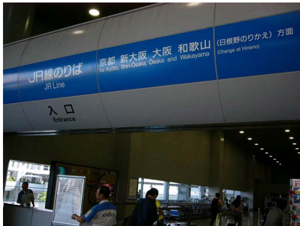
Passenger gate of the JR Kansai Airport station

(4) It takes about 50 minutes to Shin-Osaka station. There are many platforms at Shin-Osaka, you have to go to the form (usually 20,21,22) which the Shin-Kansen to Aioi or Himeji leaves. The Shin-Osaka station is very confusing. The best way to find the platform is to ask to the station staff who can speak even poor English. Show your ticket, they will take you to the proper form. Most difficult part of trip to SPring-8 is changing trains from Haruka to Shin-Kansen at the Shin-Osaka station.